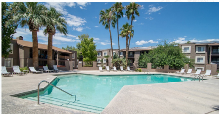
TUCSON, ARIZONA $44,575,000 Multi-Family

For 25 years, Trez Capital has been a trusted provider of private commercial real estate financing solutions in the U.S. and Canada. With over $5 billion* in AUM, we have funded more than 1,700 transactions in excess of $16.5 billion since the firm's inception in 1997.