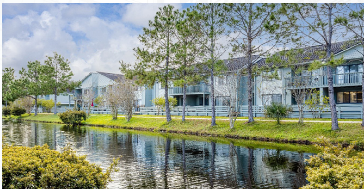
JACKSONVILLE, FLORIDA $30,000,000 Multi-Family