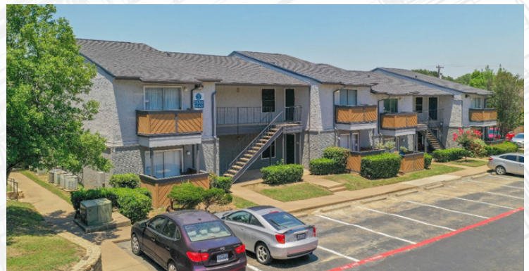
BEDFORD, TEXAS $39,200,000 Multi-Family